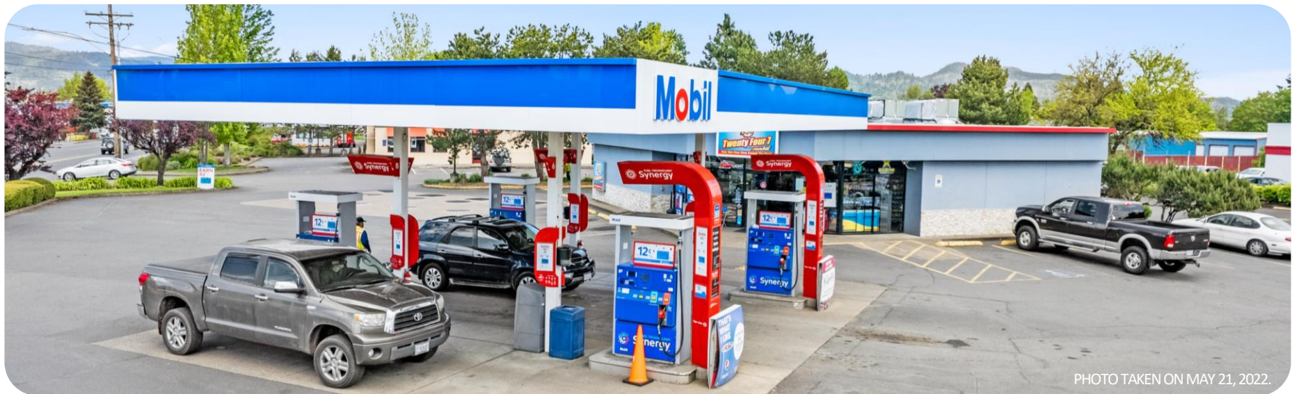
PHOTO TAKEN ON MAY 21, 2022.