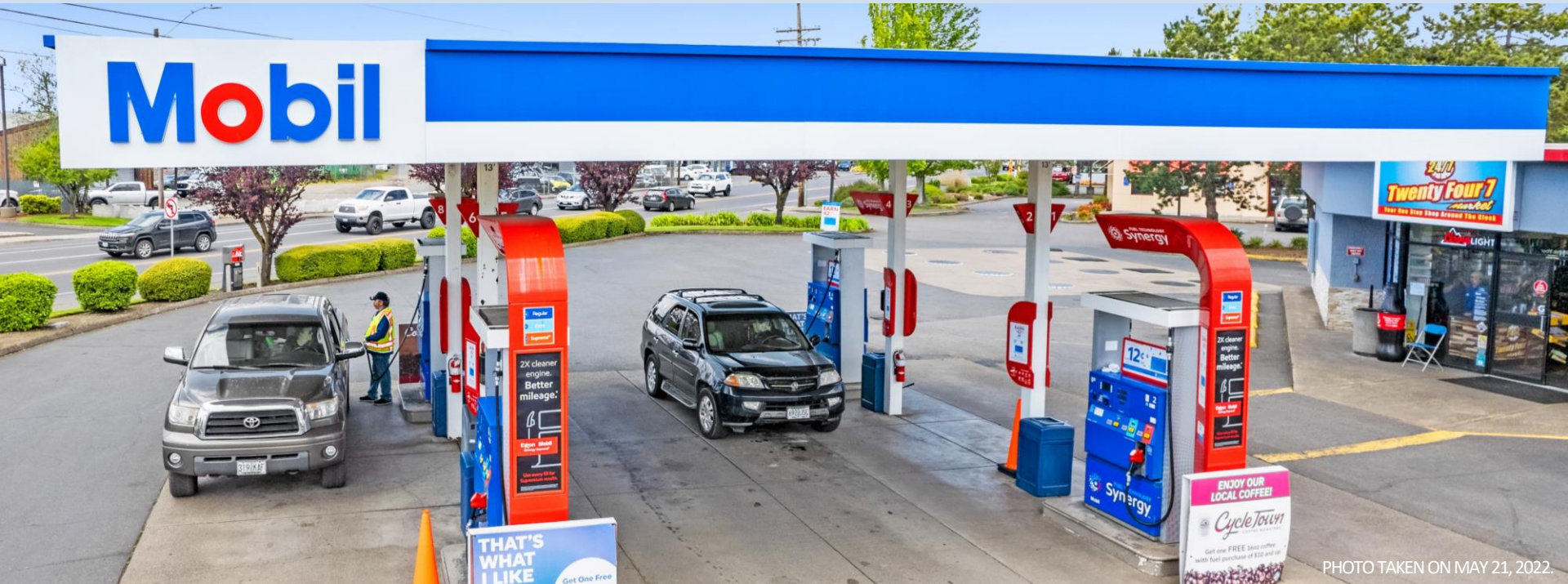
PHOTO TAKEN ON MAY 21, 2022.